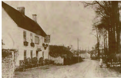
LORD NELSON EARLY 1930s